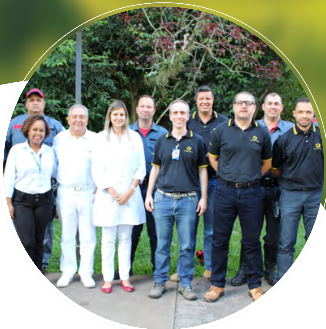
OJI's Occupational Safety, Health and Medicine Team

At OJI, Health and Safety are paramount values. The company invests energy and resources in one of its main goals: Zero Accidents. That's because people are the big reason for the existence of the organization. Ensuring their health, welfare and safety for the development of their functions is also part of the company's special role.