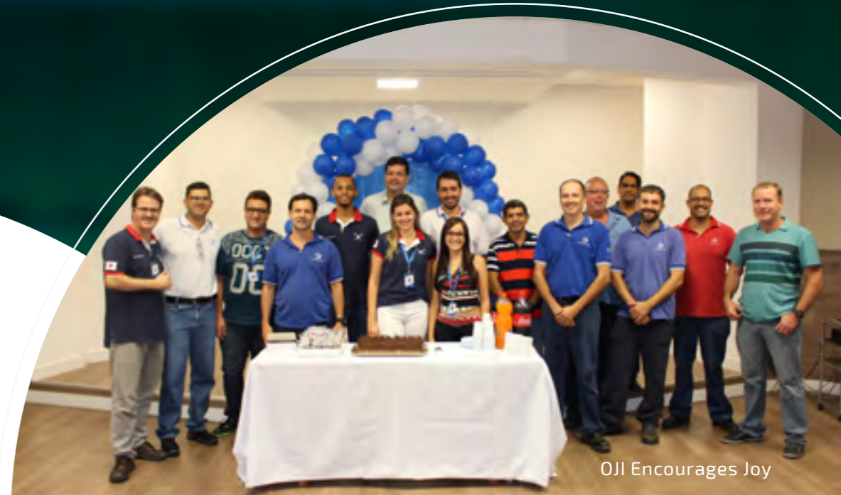
OJI Encourages Joy